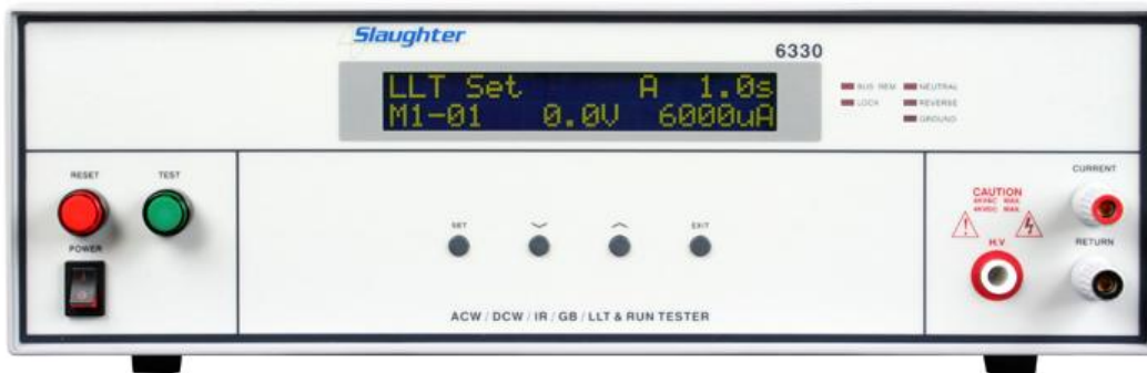
Figure 2: Slaughter Company Model 6330

Functional Run testing wasn't always easy or convenient because it often required the purchase of additional test equipment (power analyzers, digital multi-meters, etc.). Some new electrical safety testers like the Slaughter Company model 6330 (shown below) include Functional Run test capability, making it easy to verify that every DUT's operating parameters are within specification.